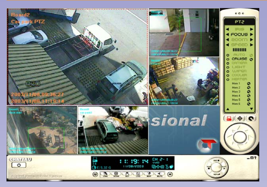
Chateau XP with 5 cameras